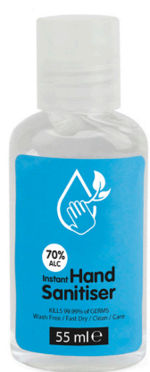
RC2055TR 55ML INSTANT HAND SANITISER Box Quantity: 192pcs. Price per pc: £0.80. Based on 2496pcs.