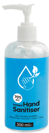
RC2300TR 300ML INSTANT HAND SANITISER Box Quantity: 48 pcs. Price per pc: £2.25. Based on 2496 pcs.