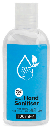
RC2100TR 100ML INSTANT HAND SANITISER Box Quantity: 96pcs. Price per pc: £1.00. Based on 2496pcs.