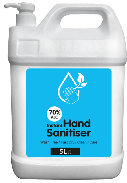
RC5000WH. 5L INSTANT HAND SANITISER REFILL PACK Box Quantity: 2pcs. Price per pc: £25.81. Based on 100pcs.