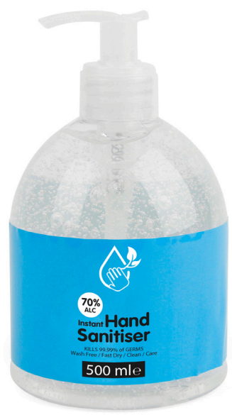
RC2500TR. 500ML INSTANT HAND SANITISER Box Quantity: 24pcs. Price per pc: £2.95. Based on 2496pcs.